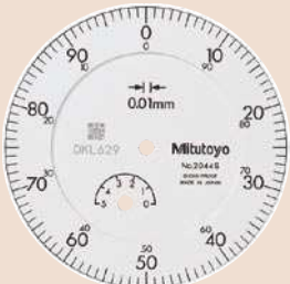
2044S 2044S-60 2044S-09