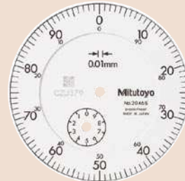
2046S 2046SH 2046S-09 2046S-15 2046S-80 2046SLB